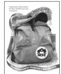
Parent Pack Pocket Folder

This sturdy, laminated folder provides a place to keep important records and documents related to your children's education. The folder also includes information on the rights of children and youth experiencing homelessness and helpful tips about enrollment and disenrollment. These posters are available in Spanish and English at no charge and can be ordered by calling 800-308-2145 or by visiting www.serve.org/nche/online_order.php .